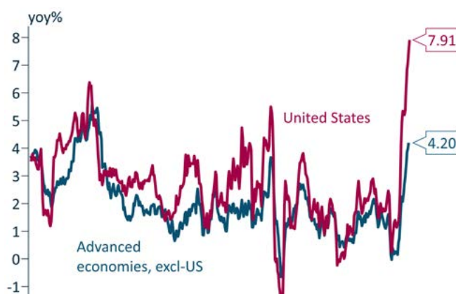
FIGURE 01 ADVANCED ECONOMY INFLATION